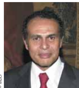
Mr. Léon Bertrand, French Minister of Tourism