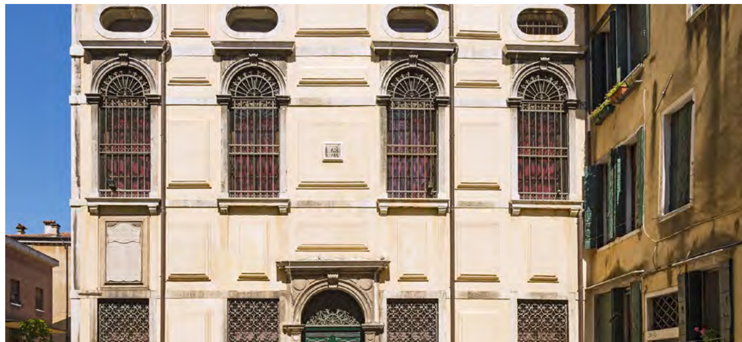
My favorite Jewish spot in Venice LEVANTINE SYNAGOGUE

“ The key ghetto stories remain hidden and unexplored, buried under a layer of seductive and powerful clichés prompted by the now globalised word 'ghetto' ”