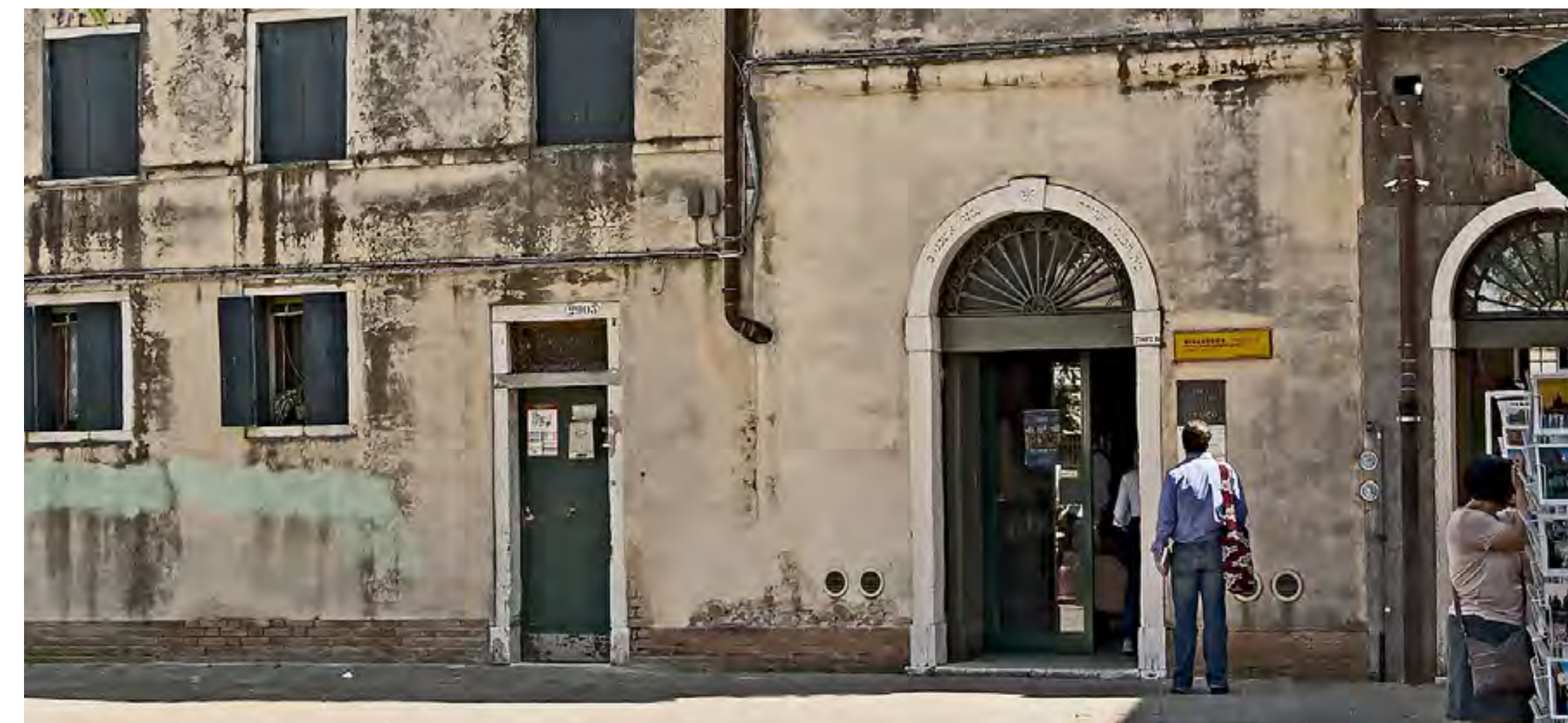
My favorite Jewish spot in Venice THE JEWISH MUSEUM